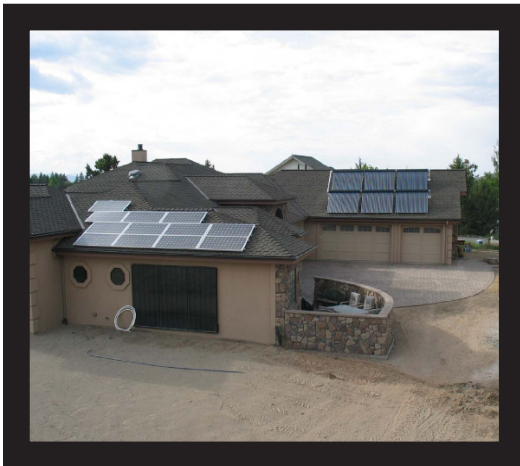
Energy Star labelled home built with LOGIX.